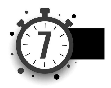
Course Duration: 7 days