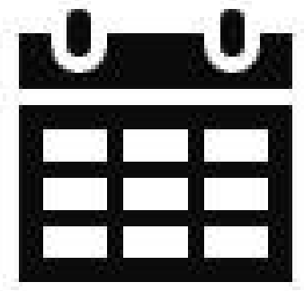
Start Date: July 26, 2022